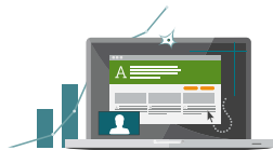
IMAGE ●●●● VIDEO ●●●● EDITING ●●●●

Snagit helps you provide better feedback, encourage teamwork, and create images that explain exactly what you mean. Quickly snag what's on your screen, enhance it with effects, and then share your creations instantly.